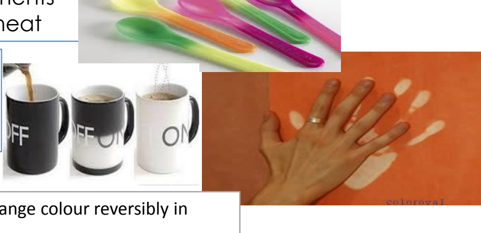
Photo chromic pigments change colour reversibly in response to light

Can you explain explain the benefits for each of these examples?